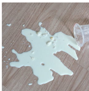
Huali flooring is resistant to accidental splashes and temporary surface water