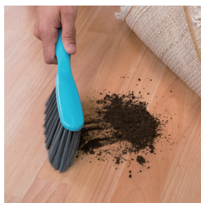
Huali flooring is resistant to everyday dirt and soil