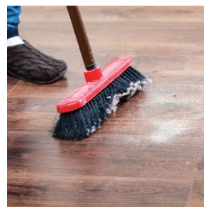
Everyday dirt and crumbs can be simply swept away